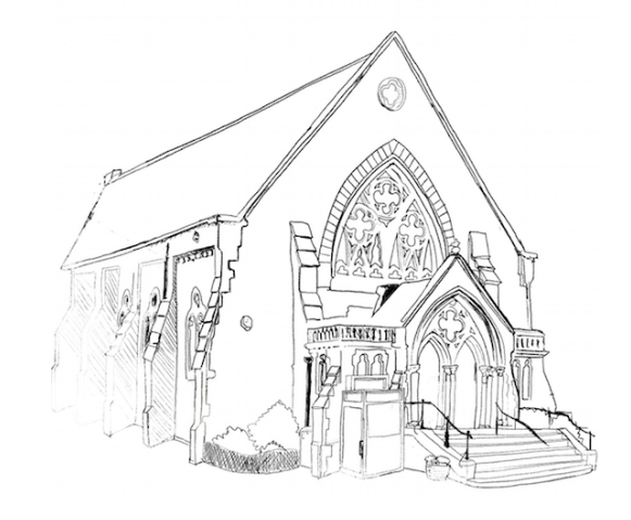
23 November 2019